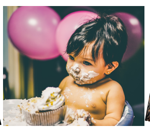
Presence of Being A personalized birthday present